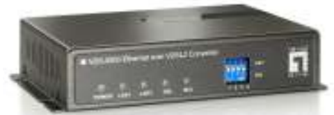
VDS-0200 (Annex A)

For networks that utilize PSTN telephone systems.