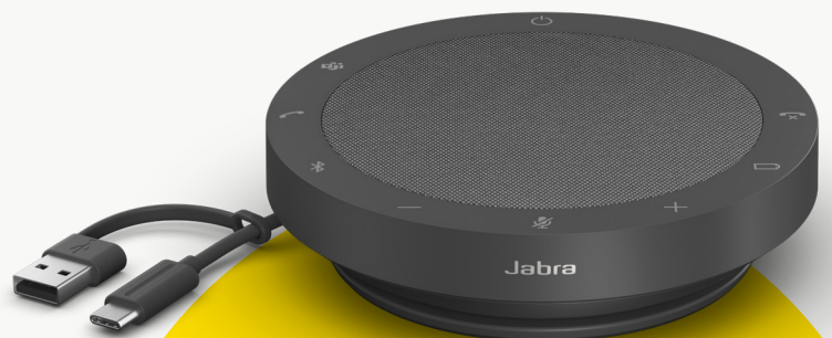
MS TEAMS & UC VARIANTS

We consider sustainability carefully at every stage of product development. The casing of Speak2 55 is made with over 50% sustainable materials**, and has a number of built-in parts that can be repaired or replaced. Better sustainability = longer speaker life = great calls for you and your team for years to come.