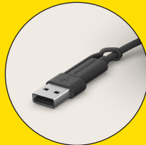
USB C and USB A connectors included