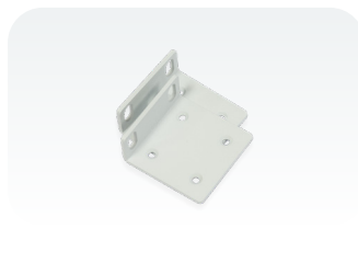
Rackmount bracket white