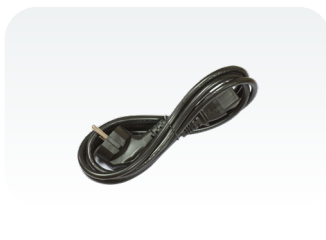
2 Power cords